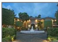
Miami Beach, FL $32,000,000 8br / 12.5ba 19,440 sqft Coldwell Banker