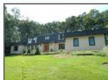
Kildeer, IL $475,000 5br / 4ba 4,818 sqft Baird&Warner