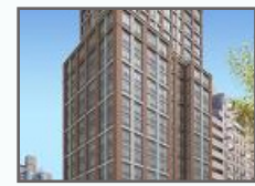
Indianapolis, IN $4,600,000 3br / 3ba 2,489 sqft Nestseekers