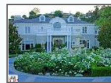
Beverly Hills, CA $29,000,000 10br / 15ba The MLS Yellow Pages