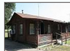
Somerville, TX $42,265 3br / 1ba 1,151 sqft Coldwell Banker Residential