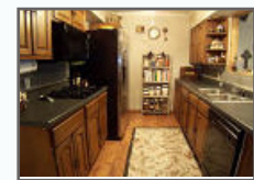
Dallas, TX $255,000 3br / 2ba 1,788 Mike Miller Group

Data based on the top 10 most viewed properties on trulia.com in November 07.