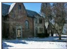
Detroit, MI $299,900 4br / 3ba Century 21