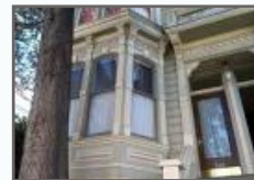
San Francisco $625,000 2br / 1.5ba 1,102 sqft