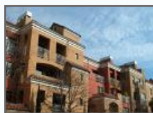
San Francisco, CA $699,000 2br / 2ba 1,103 sqft