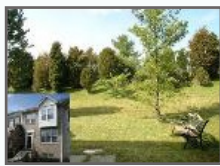
Centreville, VA $424,888 4br / 3ba 1,776 sqft