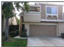
Pleasanton, CA $639,000 3br / 2 ba 1,731 sqft