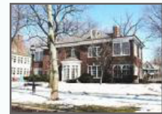
Detroit, MI $729,900 6br / 5.5ba 8,100 sqft