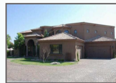
Phoenix, AZ $2,390,000 6br / 6.5 ba 5,001 sqft