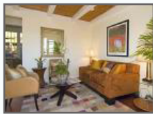
San Francisco, CA $675,000 2br / 2ba