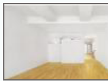
New York, NY $999,000 1br / 1ba 1,100 sqft